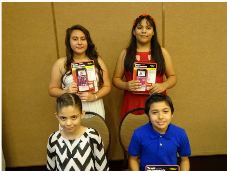
The group (Diego, not pictured)