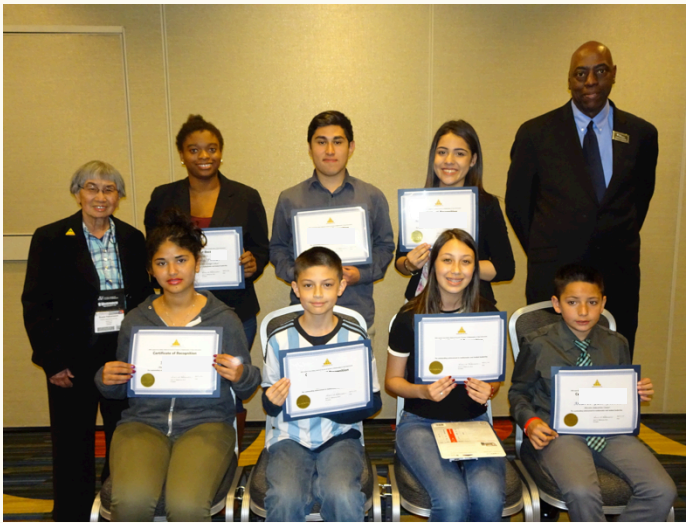
The group (Jiselle not pictured)